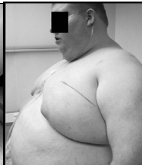
(Left) Despite only subtle changes in legs, this 19 year old man had oedema to the chest. (Right) Two older individuals with chronic changes from long standing oedema